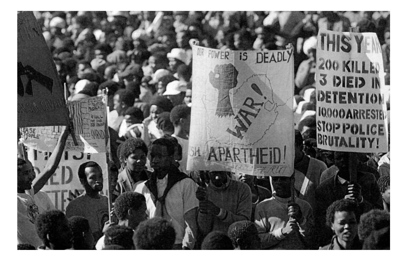
A protest in South Africa in 1986.