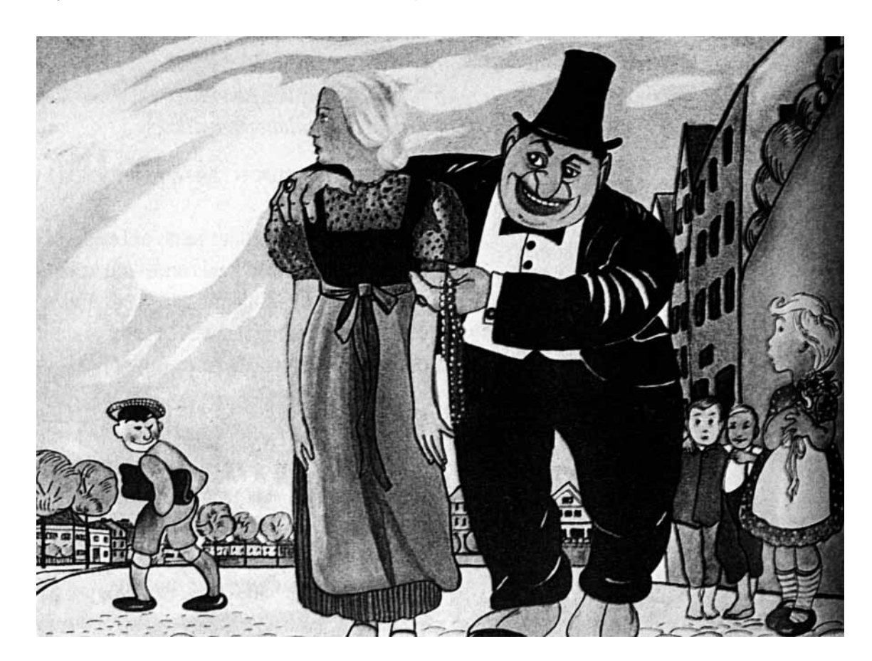
An illustration from a Nazi book to be used in schools.