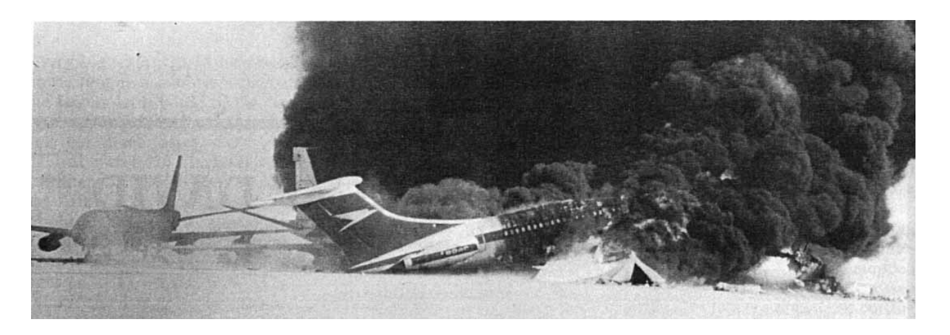
Dawson's Field, Jordan in September 1970.